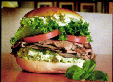
Roast beef with Basil Cream Cheese.