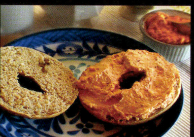
Roasted Red Bell Pepper Pesto and cream cheese on a bagel

Countless exciting sandwiches can be easily created with Armanino Pestos.