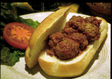
Meatball hoagie sauced with Dried Tomato & Garlic Pesto.