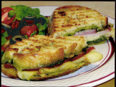
n'n'cheese panini with Basil Pesto.